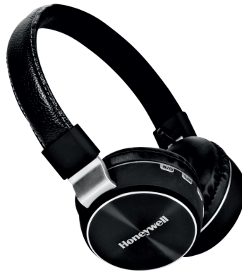
Moxie V10 Value Series

Please read the manual carefully before use