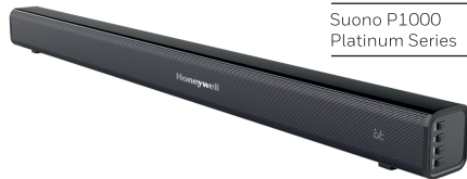
Suono P1000 Platinum Series

Please read the manual carefully before use